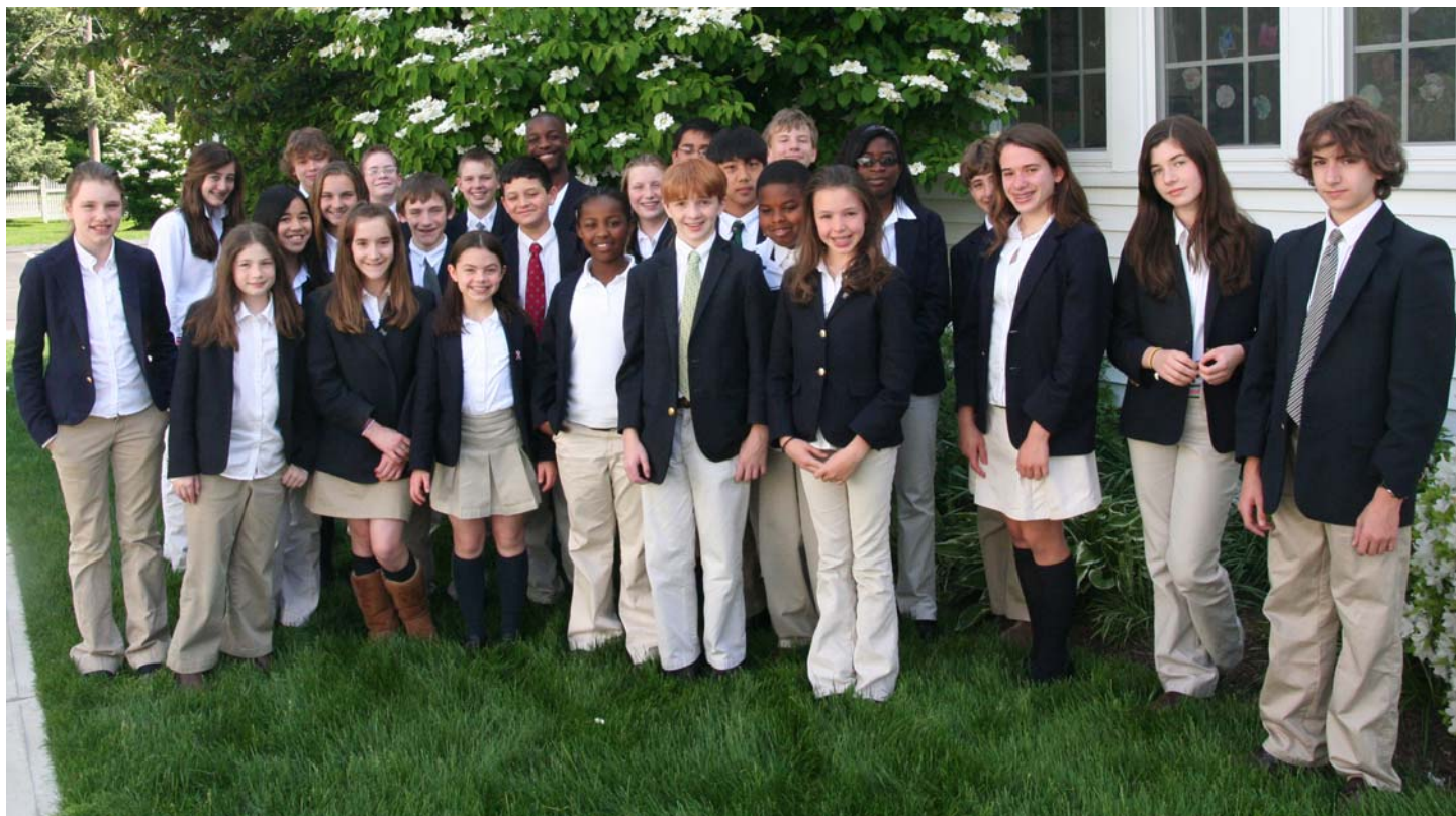
Each year the Johns Hopkins Center for Talented Youth conducts a Talent Search which identifies students who score in the 95th percentile and above on a Standardized Test such as the ERBs. Pictured about are 26 of the 32 Johns Hopkins Scholars from in Grades 5 through 8 who qualified in the 2008-2009 Talent Search.