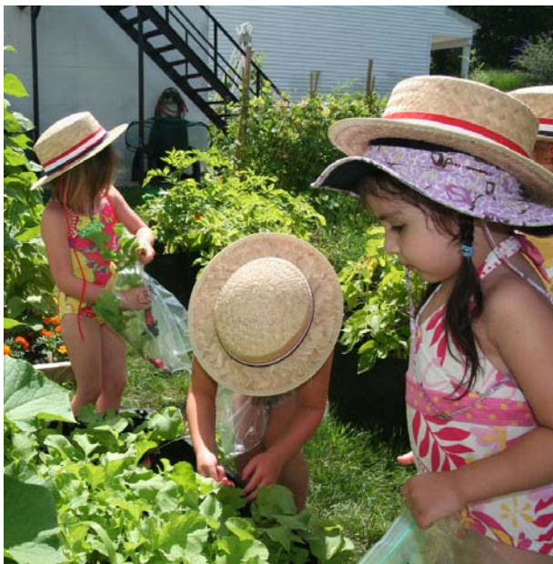
Sweet Peas working in the Unquowa gardens.