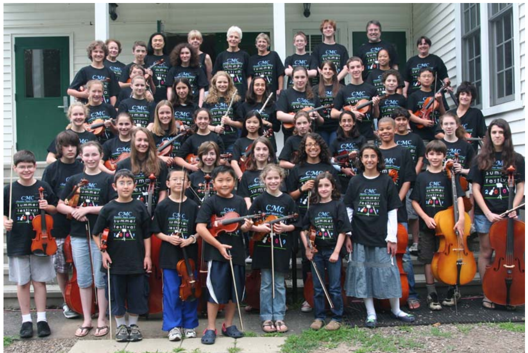
Chamber Music Central Campers from the first session.