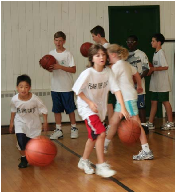
Our competition will certainly "Fear the Gator" next season after this summer's basketball clinic!