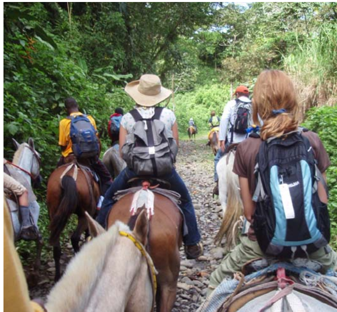
Unquowa students traveling to Monteverde by horseback. See full story on our Bulletin Board at www.unquowa.org . Click on Summer News.