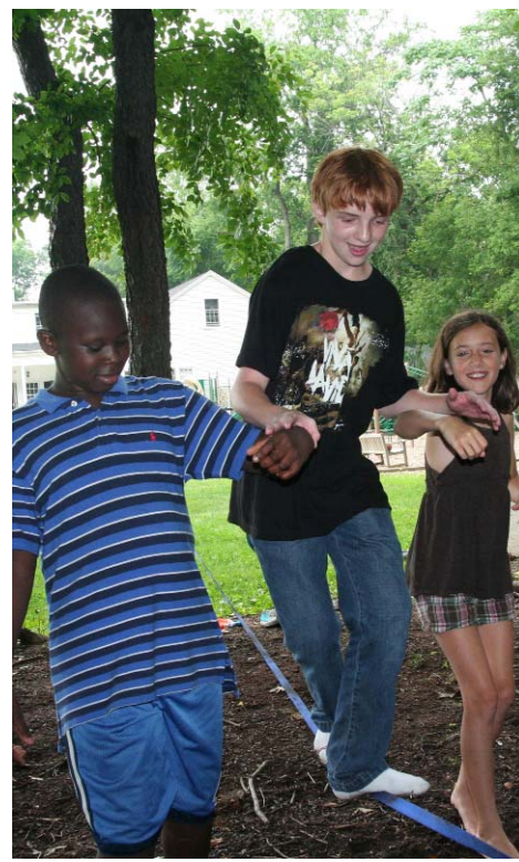
Teamwork and trust at the Improv Clinic