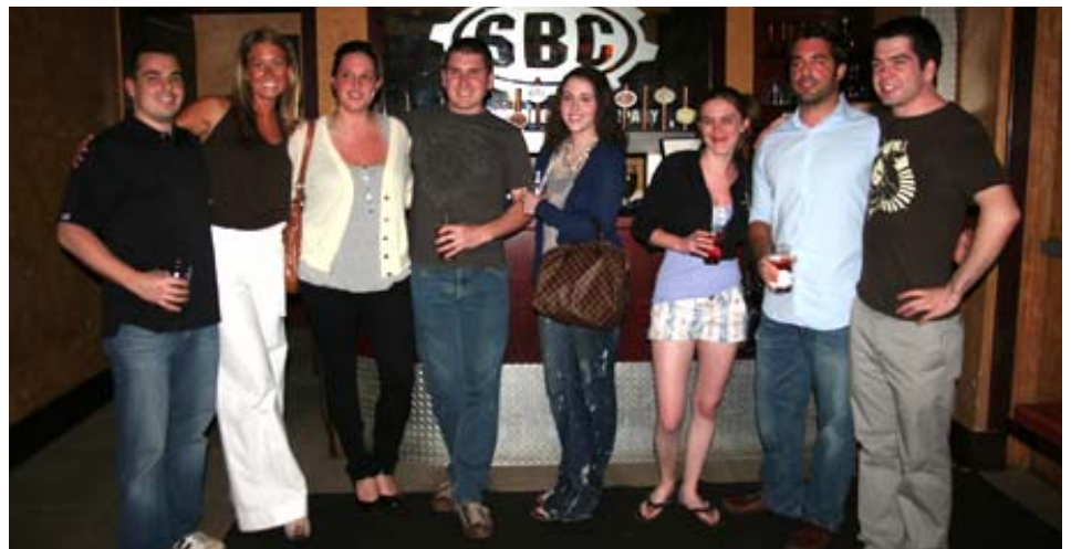
A 10 Year Reunion for the Class of 1999 was held at the Southport Brewing Company in Fairfield in May 2009. Great seeing everyone and catching up on the last 10 years!