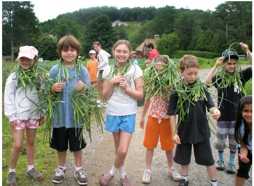
Farm campers with their harvest of garlic scapes.