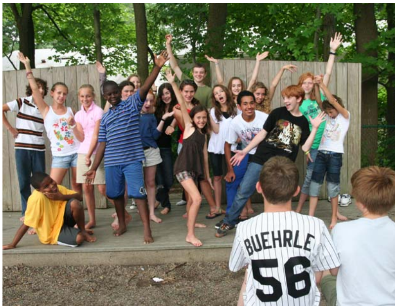
Working on Improv skits.