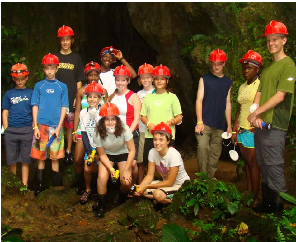
Spelunking in Costa Rica