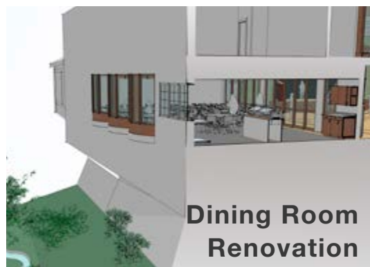
Dining Room Renovation