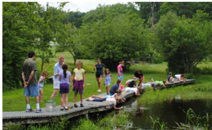
Field experiences during Farm Camp included many opportunities to explore and learn about the environment. More photos on page 8.