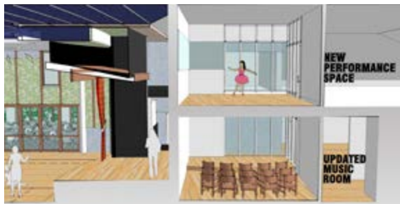
New Performing Arts Space

Thanks again to those who have already supported the campaign with a gift or three year pledge - some of you multiple times!