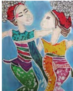
Batik by Lily Stumpf, grade 8.