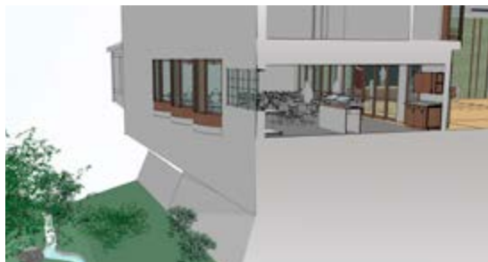
Dining Room Renovations