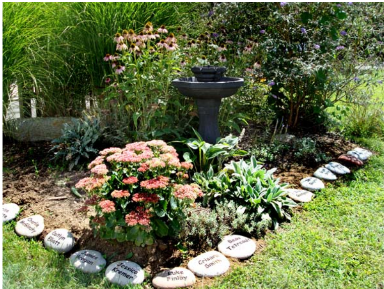
Solar birdbath and garden tiles - a gift from the Class of 2008 - are happily situated in the butterfly garden.